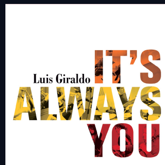
It's Always You 2008