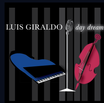
Day Dream 2002